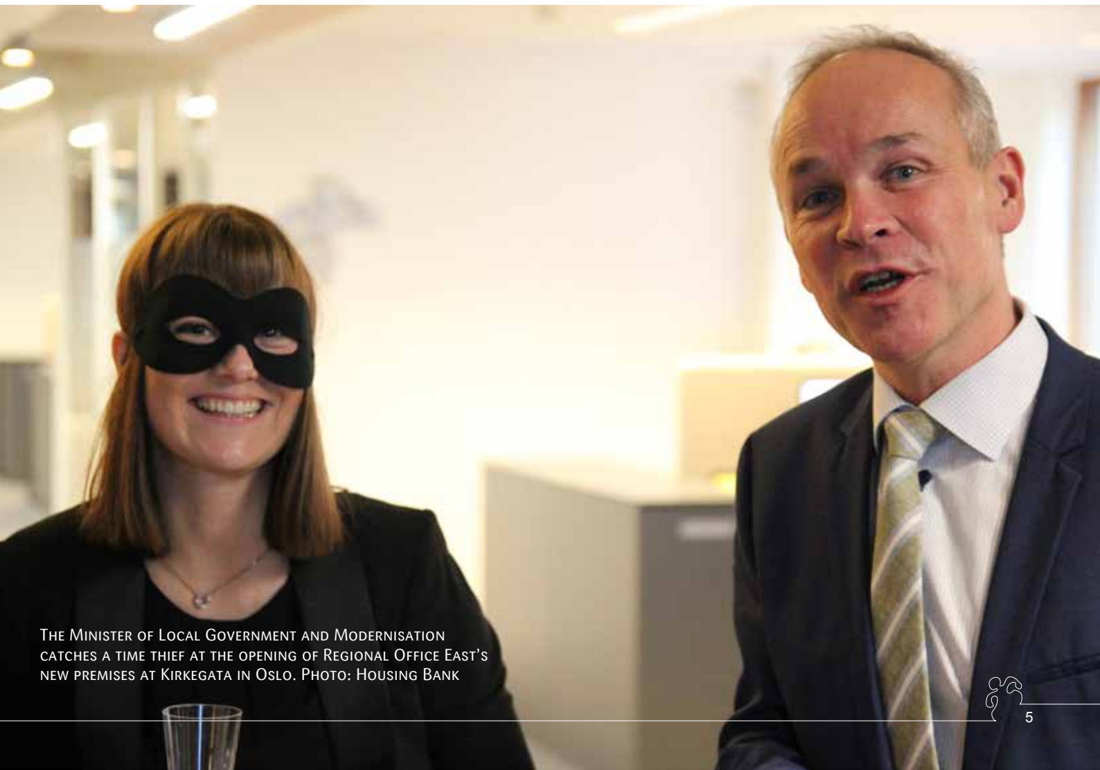
THE MINISTER OF LOCAL GOVERNMENT AND MODERNISATION CATCHES A TIME THIEF AT THE OPENING OF REGIONAL OFFICE EAST’S NEW PREMISES AT KIRKEGATA IN OSLO.

This year’s winner of the prize for best digital service deserves credit for making the application process much simpler for its users. This has been done by combining a good design with clear language and clever use of technology. The service is very clearly laid out and easy to navigate. The language is friendly and user-oriented, and the service is designed to act as a written agreement between the agency and the user. Technology is used cleverly to collect relevant information from other records, and to adapt questions to the individual circumstances of users.