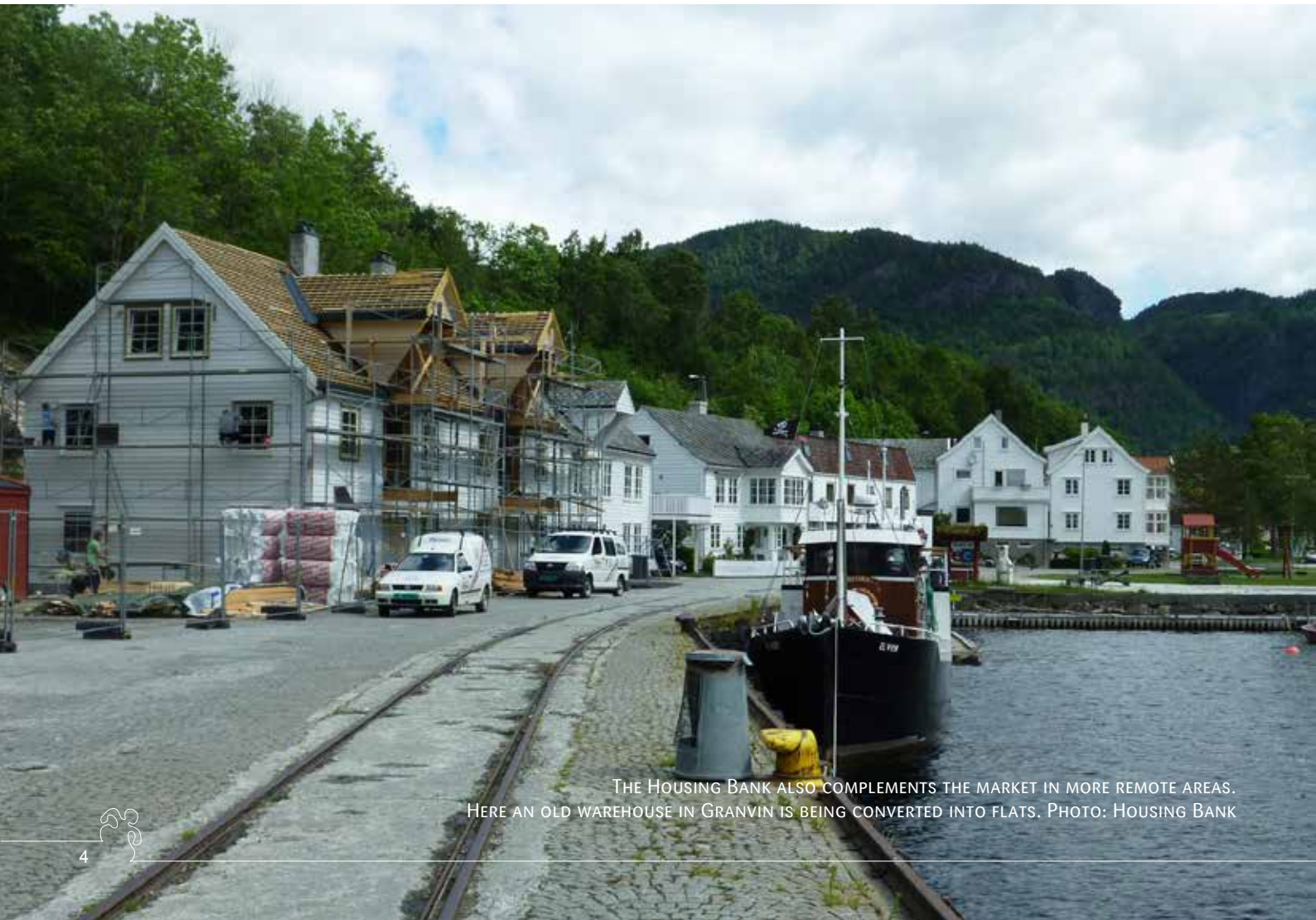
THE HOUSING BANK ALSO COMPLEMENTS THE MARKET IN MORE REMOTE AREAS. HERE AN OLD WAREHOUSE IN GRANVIN IS BEING CONVERTED INTO FLATS.

In recent years, the Housing Bank’s strategy has involved working very closely with municipalities and the construction industry in order to develop good housing solutions. This partnership has produced tangible results, and the vast majority of people now have good housing arrangements. However, some people still struggle to enter the housing market, and need help to find a suitable home. Complementing the market, to enable these people to find a suitable place to live, will remain the Housing Bank’s most important task within housing policy going forwards.